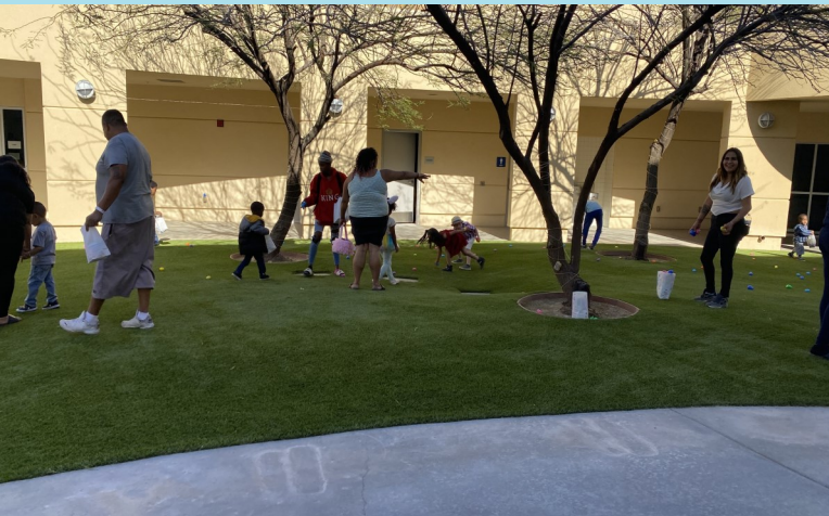
Pictured above: And they're off! Easter egg hunt is commencing and the kids are hype