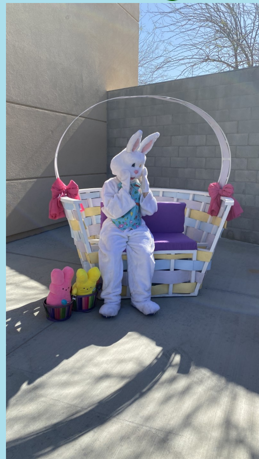
Pictured right: Easter bunny waiting for pictures with the kiddos