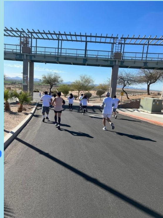
Pictured left: Puente 5k runners taking off down the hill

Puente 5k was a success! Thanks to everyone who came to run and those who came to support the runners! A special thanks to the Puente program for holding the event