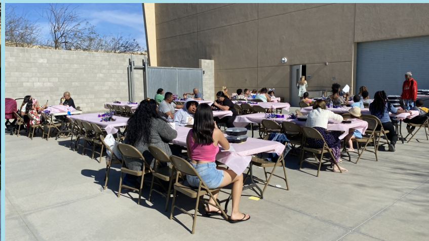
Pictured above: All guests having a great time and enjoying the food provided