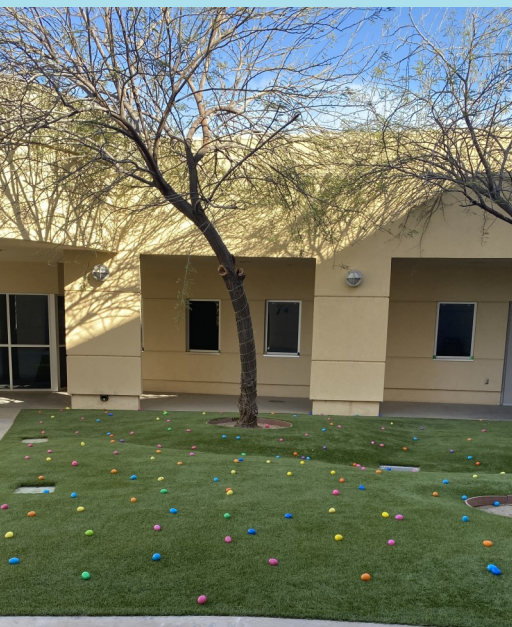
Pictured left: Easter eggs set out, waiting to be picked