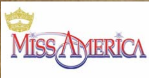
On the road to Miss America

Miss Blythe rehearsals are taking place the month of September in the Palo Verde college Theater with the show scheduled for 6:00pm on October 1, 2016. Support the Miss Blythe contestants by purchasing your ticket early! ASG will be selling snacks and waters during intermission. The funds raised by ASG will go toward scholarships and student activities.