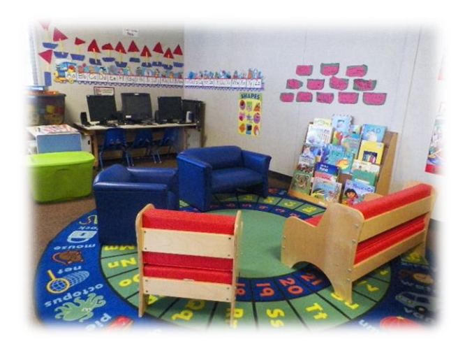
"This Program is a great resource to have in Blythe... I am extremely satisfied with the services"

The Child Development center provides quality instruction and services for our parents and children, and applaud the achievements of parents, students and staff. The Palo Verde College Child Development Program and the Palo Verde Community College agree that it is to their mutual benefit that students have the opportunities for field education as students and future practitioners. Just like the Palo Verde College, the Palo Verde College Child Development Center is committed to excellence and encourages parents to continue their education. The Palo Verde College Child Development Program promotes Palo Verde College as an exemplary learning environment with high quality educational programs and services.