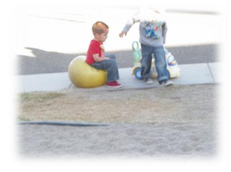
"This Program has helped me succeed in school, I am very pleased with the program and staff".