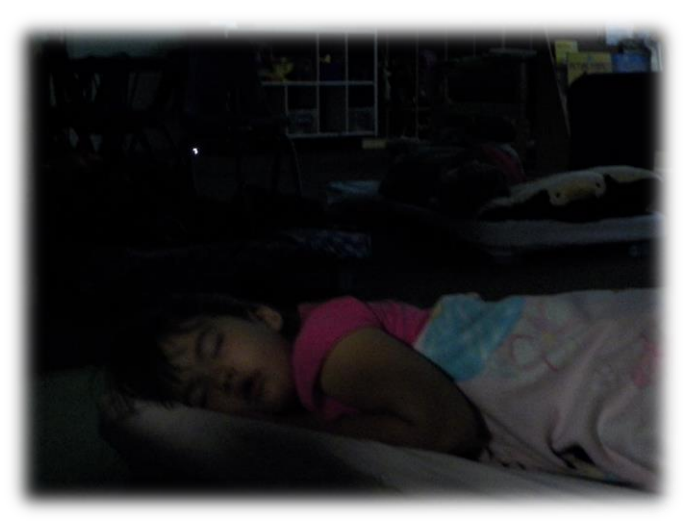
"This program is very helpful in assisting me in completing my education. I know my child is safe here. Thank you!!