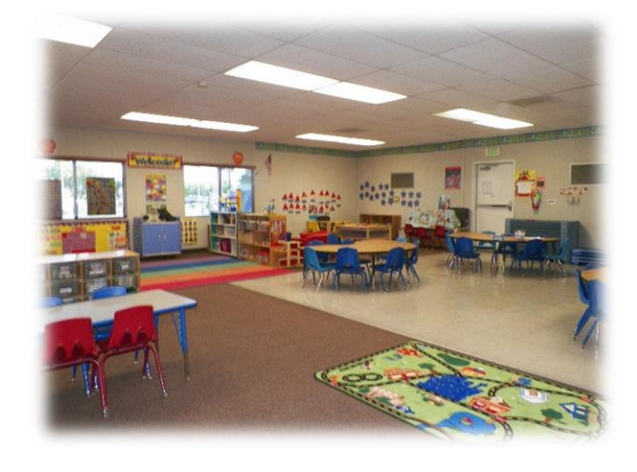
"My child loves this program & enjoys coming to school every day"