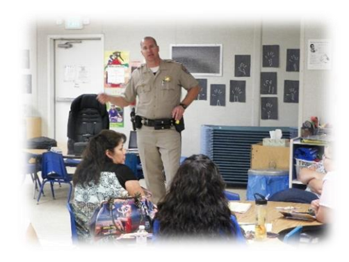
"I like the way other programs come to the school and offer assistance for families"